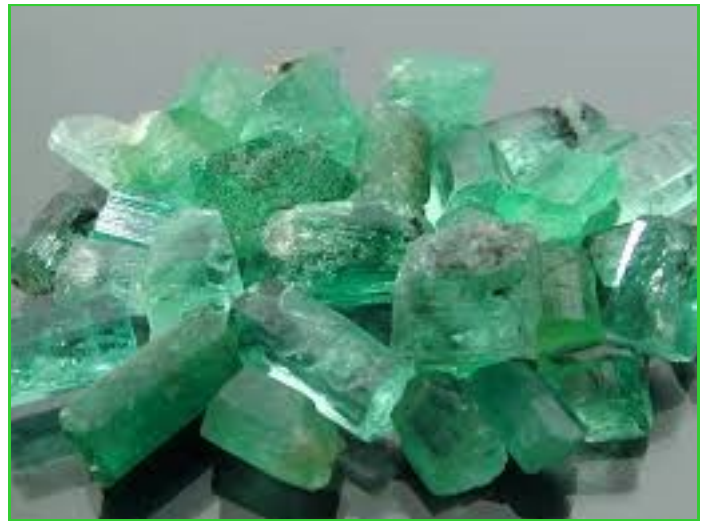
Emerald Rough from Muzo, Columbia

As I explained for Aquamarine (another form of beryl) in the March issue, the crystal structure of beryl is characterized by sixfold rings of [SiO 4 ] tetrahedra that lie on top of each other and thus form endless channels along the c -axis of the crystal. The rings are linked by [BeO 4 ] tetrahedra and [AlO 6 ] octahedral. In addition to the main elements of beryl, minor amounts of Li, Na, or other alkalioid metals can be present (like H 2 O or CO 2 , they can be accommodated in the channels.) Color is caused by chromophores in the form of transition elements, and typically, Chromium (as Cr 3+ ) is responsible for the deep-green in emerald. Vanadium may also act as a chromophore, either by itself, or in concert with the Chromium. Though Iron may color beryl green, it is not considered an emerald unless the chromophore is Chromium or Vanadium (Iron-green beryls are simply called "Green Beryl" or even labeled as aquamarines...) With aquamarines, the crystals are often long; by contrast, pink beryl (Morganite) typically assumes short, stubby, tabular crystals. Emerald falls in between these ranges, with mostly shorter, smaller crystals that are very rarely tabular.