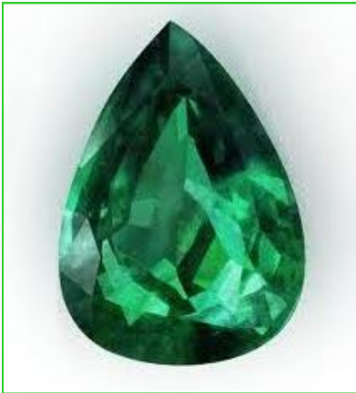
6.84 Carat Fine Gem Emerald From the Author's Collection

May's birthstone is the fabulous variety of Beryl known as Emerald . Beryl forms commonly as simple, prismatic, hexagonal crystals, whose prism faces are often vertically striated or grooved. It has indistinct cleavage on the basal {0001} plane, and conchoidal or uneven fracture. Hardness varies from 7.5 - 8.0 on the Moh's Scale, with relatively-fragile emerald usually coming in closer to 7.5. It has a density of roughly 2.7. It has a vitreous luster, is transparent to translucent, and large crystals can vary in transparency. This is especially true with emerald, whose formation happens in such violently magmatic conditions as to virtually assure a variety of inclusions (emeralds are known for their Jardin , a French word for "Garden"- the mass of inclusions leaves the impression of a painted garden landscape...)