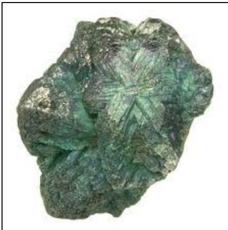
Natural "sixling" Chrysoberyl crystal group with Alexandrite coloration.