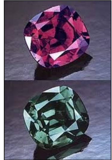
Fine-gem quality faceted Alexandrite showing both indoor (incandescent) and outdoor (full-spectrum) colors.