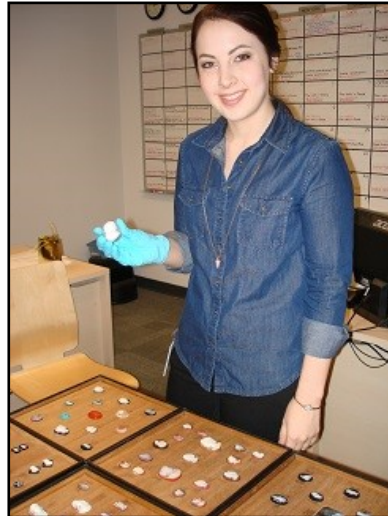
2.) Right 3.) Far Right