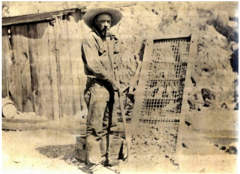
Miner at Salero Mine c. 1908