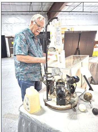
The sphere machine garnered the most attention. These photos courtesy of Bill Penrose.

the capping machine, faceting machine, and wax carving for casting. These pictures are of the display cases. Next year I hope to have more member involvement in displaying their work. The cases were arranged to maximize displaying what was available to show so we had a nice presentation.